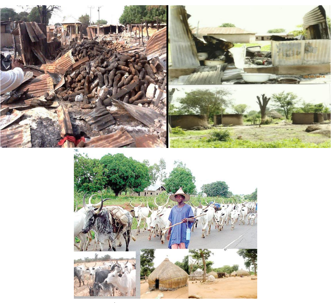
Taraba State, Nigeria.