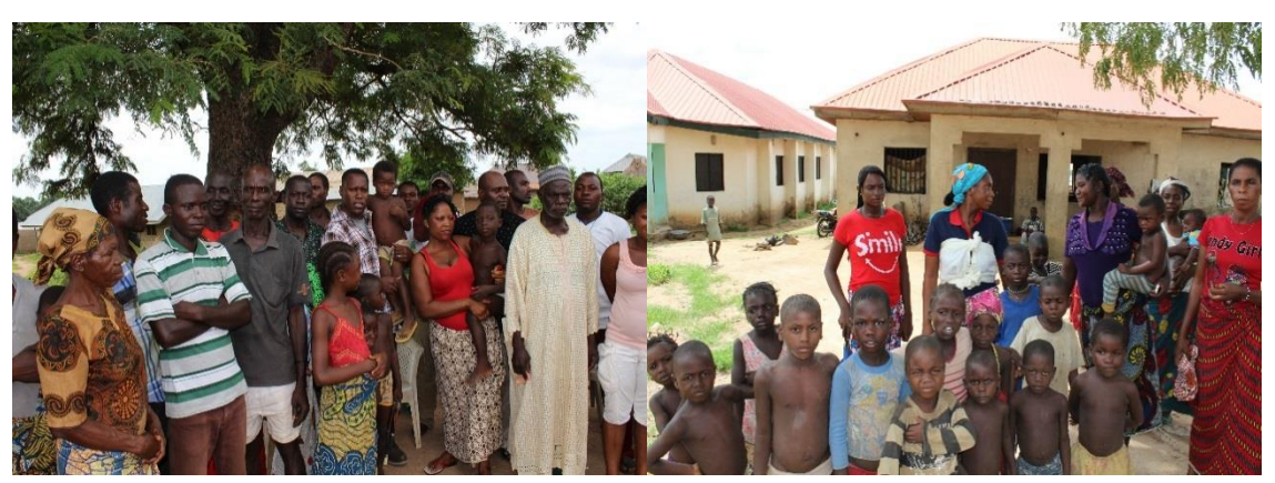
Some of the displaced people at Bali

Remarks on Taraba State IDP camps: In Taraba State, there are 10 existing IDP camps with an estimated 11,898 IDPs. Four of these camps are found in Bali LGA (central Taraba) with an estimated 2,400 IDPs, all Christians. Then there are two camps in Mutum Biyu (central Taraba) with 2,696 IDPs, both Christians and Muslims. The inclusion of Muslims in the Mutum Biyu IDP camp is not surprising because as the conflict raged, there were fears of reprisal attacks by Christian groups against Muslims. Considering the dominant presence of Christians in southern Taraba, Mutum Biyu became a likely destination for Muslim IDPs. This is because towns and villages around Mutum are populated by Muslims, and secondly, Mutum is very close to the capital Jalingo and the deployment of security forces can therefore reach the area to protect Muslims more quickly. Other camps are situated in Jalingo (northern Taraba), Ibi and Takum (both southern Taraba). NSCAN teams found out that a considerable number of the displaced Christians camping in Benue state had been absorbed into different families and communities around the Taraba-Benue border.