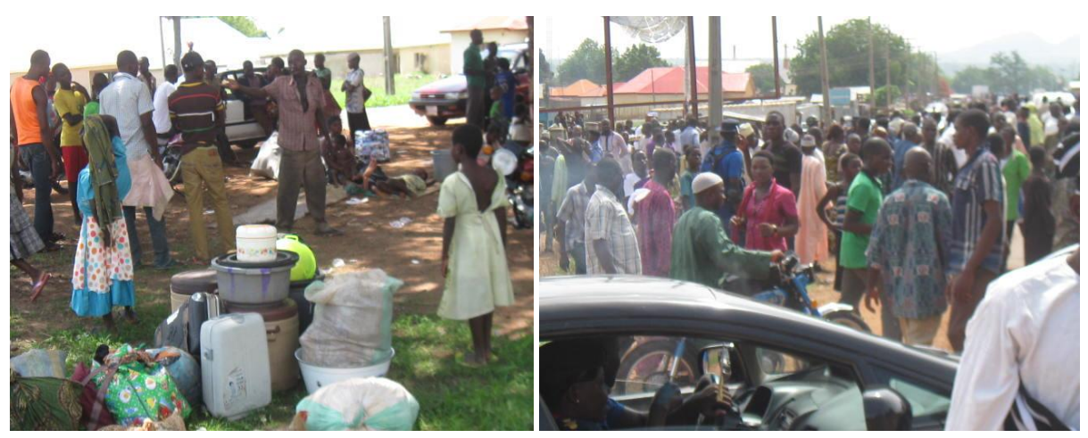
Some of the displaced Christians from Taraba in and on their way to Benue

Remarks on Benue State IDP camps: In Benue State, there are 6 IDP camps hosting about 12,664 Christian IDP's from Taraba State. This, according to some observers, is not unconnected with sociocultural ties that most of the displaced Christians in Taraba State share with the border people of Benue State. Most of those in the Benue IDP camps belong to the Tiv ethnic groups. Their ancestors and forefathers are alleged to have migrated from Benue to Taraba centuries ago. Although most of the IDPs were born in Taraba State, they have kept the socio-cultural ties with their kith and kin in Benue State. Facing the Hausa-Fulani Muslim herders' onslaught, they have found themselves taking refuge with their brothers across the border in Benue State.